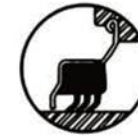
TRL type seal

带座轴承代号 轴径 外形尺寸 (英寸) 或 (毫米) 螺栓 轴承代号 座代号 重量 Bearing Unit Shaft Dia Dimensions(in)or(mm) Bolt Used Bearing Housing Weight